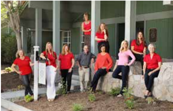
Bullock-Russell Realty Team

The Bullock-Russell Real Estate team has been an instrumental source of support. They helped with the initial cleanup of the sanctuary, donated furniture and other home goods, and have been the primary source for decorating all the homes. A member of their team has also offered their home as an evacuation site in the event of an emergency at the sanctuary.